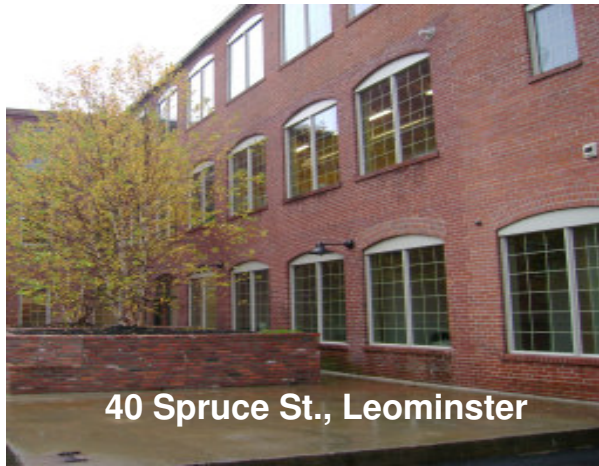
40 Spruce St., Leominster